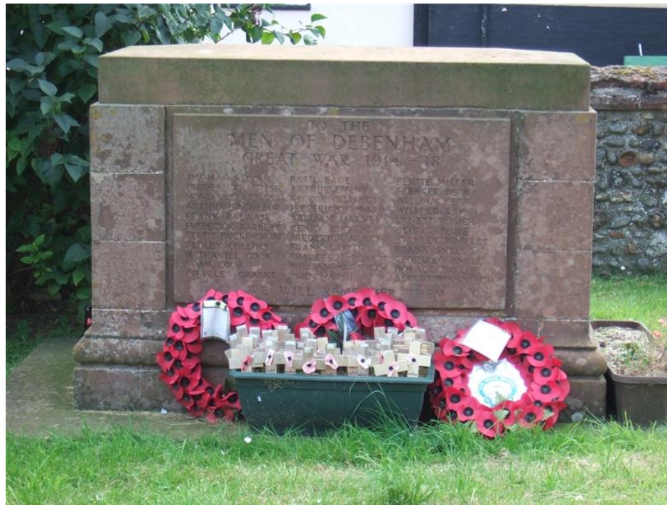
Debenham Church Yard